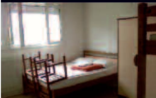
A room at the reception centre in Créteil