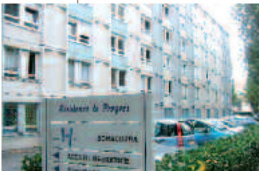
The Transit Centre in Villeurbanne