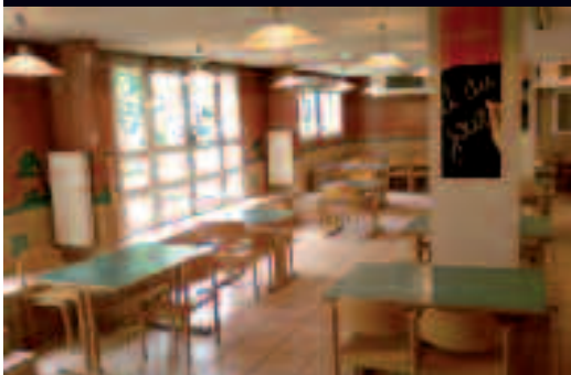
The restaurant at the reception centre in Créteil (breakfast, lunch and dinner provided for by the Centre)