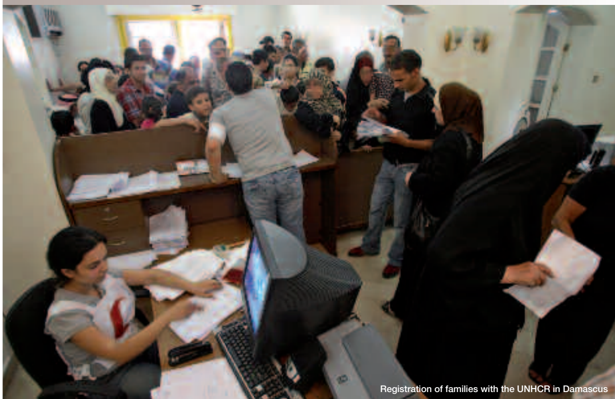
Registration of families with the UNHCR in Damascus