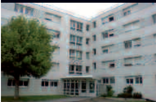
The reception centre in Créteil